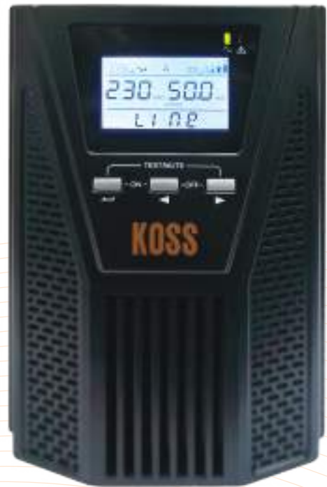
Axcell AX - 3K